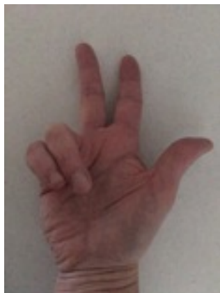
Figura 2 - The new Chakra Sensor discovered by Tetsuro Saito